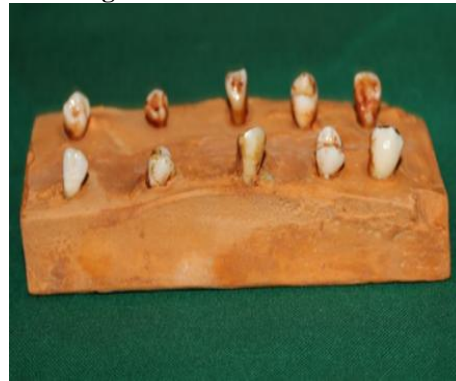
Figure 2: Labial surface of the pan stained teeth post laser bleaching