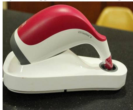
Figure 4: Shade evaluation using Digital spectrophotometer