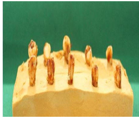
Figure 1: Labial surface of the pan stained teeth before bleaching

After the end of the bleaching process for the different groups, the color of the teeth was again evaluated. For each specimen, variation of the values as ( \Delta ) of L*, a* and b*, subtracting the value found after the bleaching from the values measured in the pre-treatment tooth was calculated using Vita Easy Shade spectrophotometer and change in the \Delta E^* values for each individual sample was depicted on spectrophotometer using the formula - \Delta E^* = [(\Delta L^*)^2 + (\Delta a^*)^2 + (\Delta b^*)^2]^{1/2}